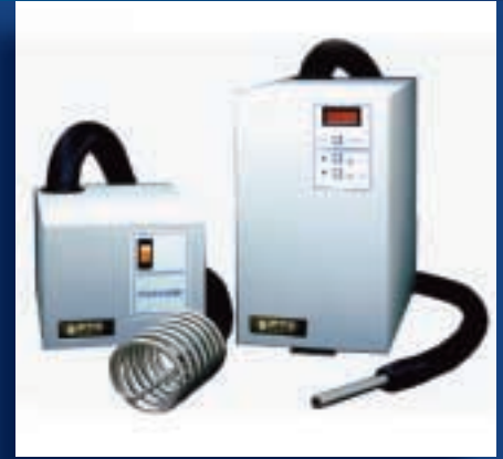
FlexiCool immersion probes (ambient to -80^{\circ}\text{C} )

FTS also specializes in custom system configurations to meet end-user needs or in partnership with original equipment manufacturers.