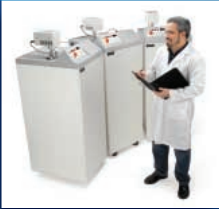
Full line of Recirculating chillers (to -90^{\circ}\text{C} )