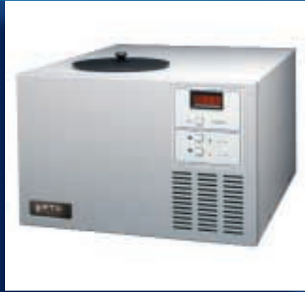
Eliminate \text{LN}_2 and dry ice with MultiCool baths ( 100^{\circ}\text{C} to -80^{\circ}\text{C} )