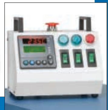
AirJet XE shown in mobile integrator configuration.