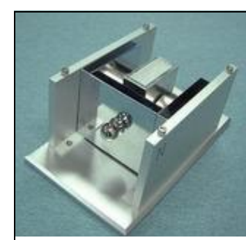
Sample kit with 0.55 Tesla magnet supplied standard with the system.