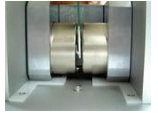
Optional 1.0 Tesla sample holder kit available for use in measuring low mobility samples. For use at 300K only. To use with Spring Clip Type board, please specify model SPCB-0

(When using the Spring Clip Board, usually contacts must still be applied to the sample corners to insure good probe contact).